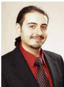
And Surekcigil Turkey