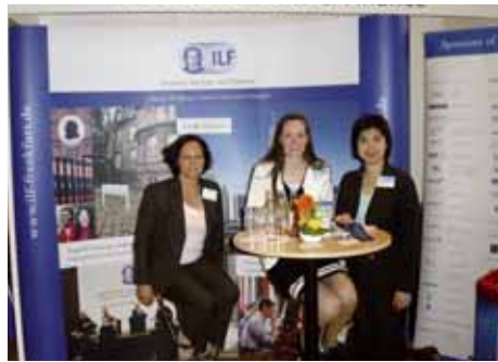
ILF Representatives at JuraCon Frankfurt

We look forward to these cooperations in the near future.