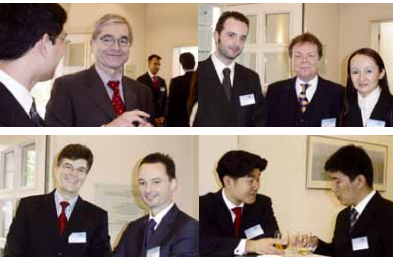
Snapshots taken during the lunch break

Students of the 2006/2007 class were invited to an informal lunch served during the break between the two meetings. It was the first of many opportunities for our students to meet ILF sponsors.